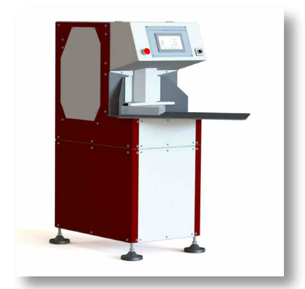
MODEL EQUIPPED WITH BASE AND 50x70 TABLE