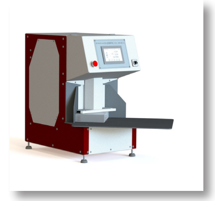
TABLE TOP VERSION WITH 50x70 TABLE