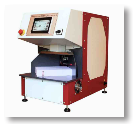
TABLE TOP STANDARD MODEL

Three models are available, 1, 2 and 3, to be equipped with a wide choice of accessories, in order to fit every need in the Commercial Printing and Converting sectors.