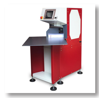
MODEL EQUIPPED WITH BASE AND 70x100 TABLE