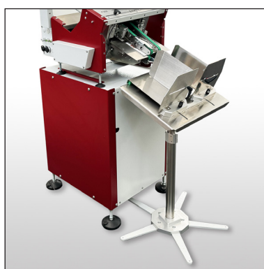
Application on Feeder F350