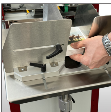
Slot for products extraction